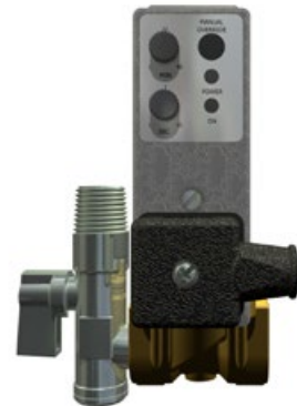
Adjustable Timed Electric Drain