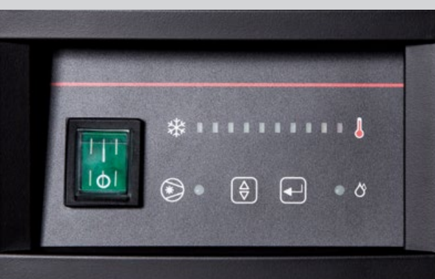
Controls: Models 200-1200 scfm