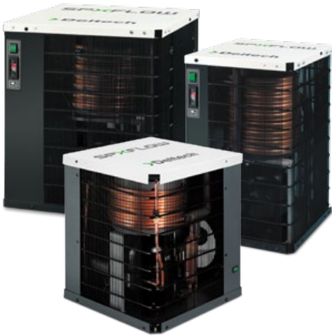
Efficient Smooth Copper Heat Exchangers

Customers around the world have relied on Deltech for great value in air treatment solutions. Deltech Value Line Refrigerated Dryers offer a simple solution based on a long history of industry leading technology.