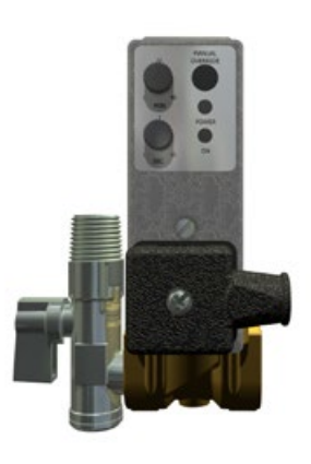
Adjustable Timed Electric Drain