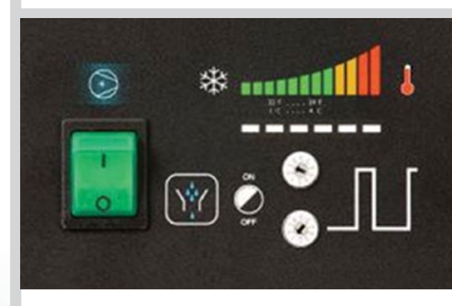
Controls: Models 200-400 scfm